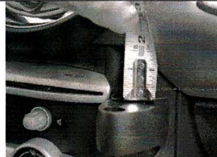
Approximately 1-1/2" from dash pad